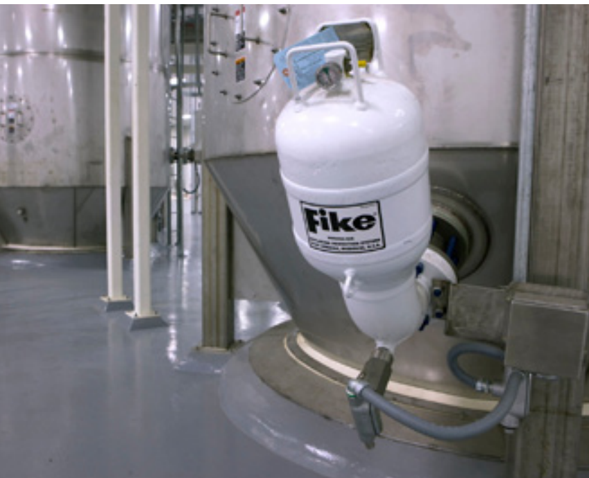
Figure 4. Multiple units now are installed at Port Wentworth sugar refinery.