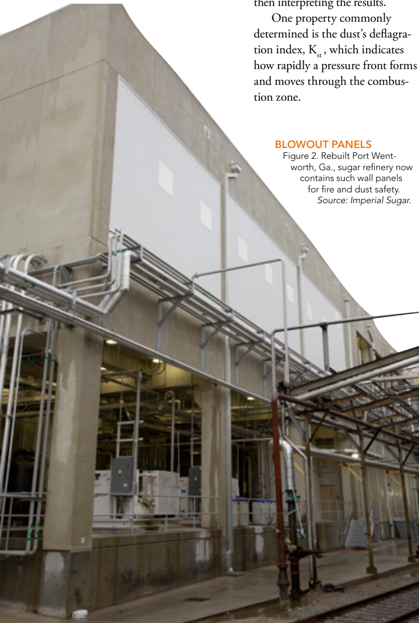
Figure 2. Rebuilt Port Wentworth, Ga., sugar refinery now contains such wall panels for fire and dust safety.

“Often, those interpreting the data are seeking guidance on the interpretation for the value reported. Their question asks whether a ‘low value’ for the K_{st} means there is no problem from the dust in terms of explosibility. The answer to that question is NO. There is no target or threshold value below which no hazard is assumed. Lower values of the index just mean the rate of rise of the pressure with respect to time will be ‘slower’ (in a relative sense) than other materials that have higher values for the index. The damage pattern from a low K_{st} value dust is different than the damage experienced when the index is greater, but the overpressure is still present and capable of destroying structures — and the fireball also poses a hazard to both personnel and the facility”, Colonna says.